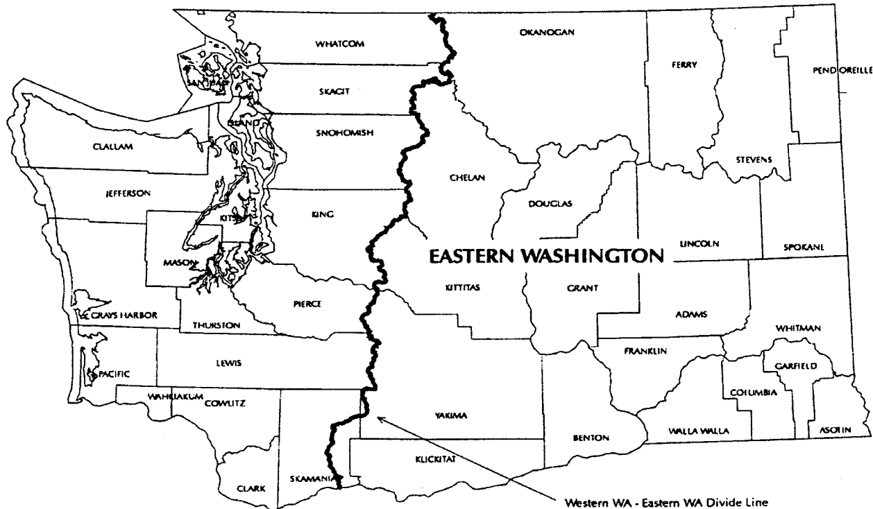
Eastern Washington Definition Map

" Eastern Washington timber habitat types " means elevation ranges associated with tree species assigned for the purpose of riparian management according to the following: