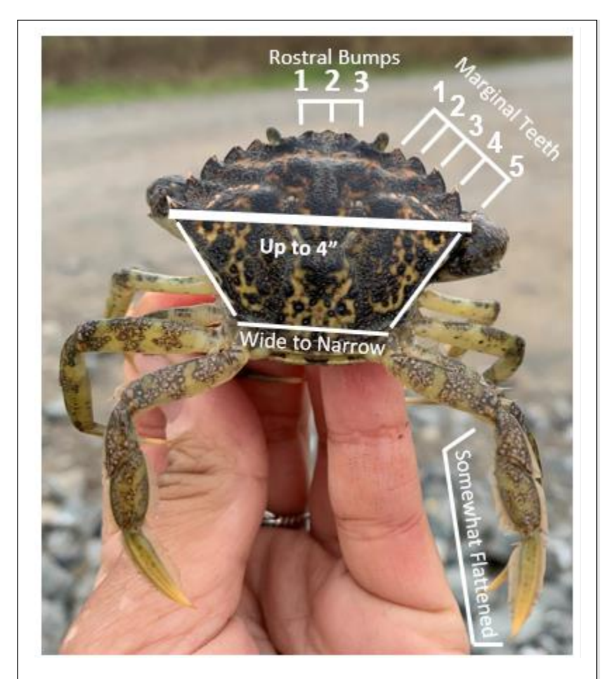
Figure 1. Image of a European green crab (EGC), Carcinus maenas, with distinguishing features highlighted. The main distinguishing feature of EGC are the five spines, or marginal teeth, on each side of the carapace behind the eyes. Additional identifying features are the three lobes, or rostral bumps, between the eyes, and somewhat flattened rear legs.