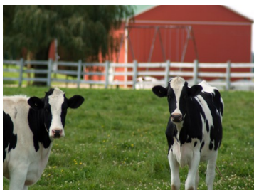
Washington Dairy Farming

Centers for Disease Control and Prevention