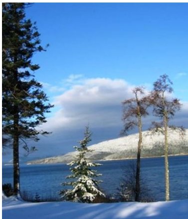
Guemes Island, WA

Centers for Disease Control and Prevention