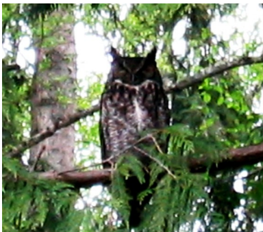
San Juan Islands Great Horned Owl

Some population groups are disproportionately impacted by TBI: