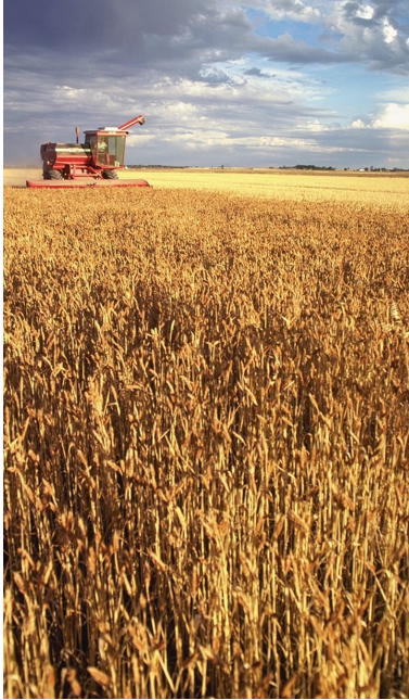
Eastern Washington Wheat

A TBI is caused by a bump, blow or jolt to the head or a penetrating head injury that disrupts the normal function of the brain.