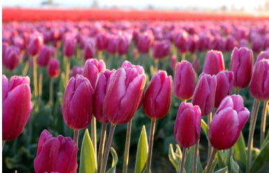
Skagit Valley Tulips