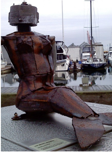
Percival Landing, Olympia

Falls are the leading cause of TBI. Rates are highest for children aged 0-4 years and for adults aged 75 and older.