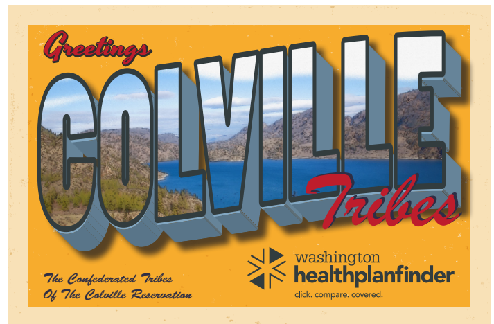
Tribal Outreach Postcards - Nisqually and Colville