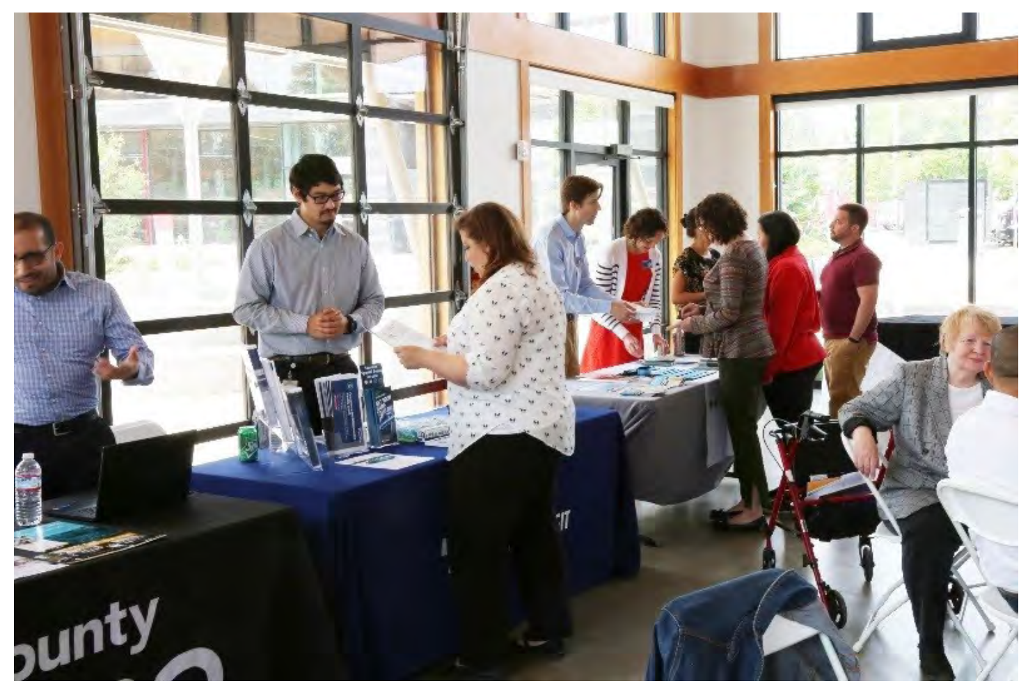
Employers speak with program representatives at South King County Employer Resources Lunch and Learn.

For advisors, the 6th Avenue Business District meeting was a good opportunity to receive collective feedback on the program. Many employers identified barriers due to size (some businesses had less than five employees and were not ORCA Passport eligible) or employees with shifts outside of normal Pierce Transit schedules (many of the employers were restaurants and bars, with employees starting either very early in the morning or ending very late at night).