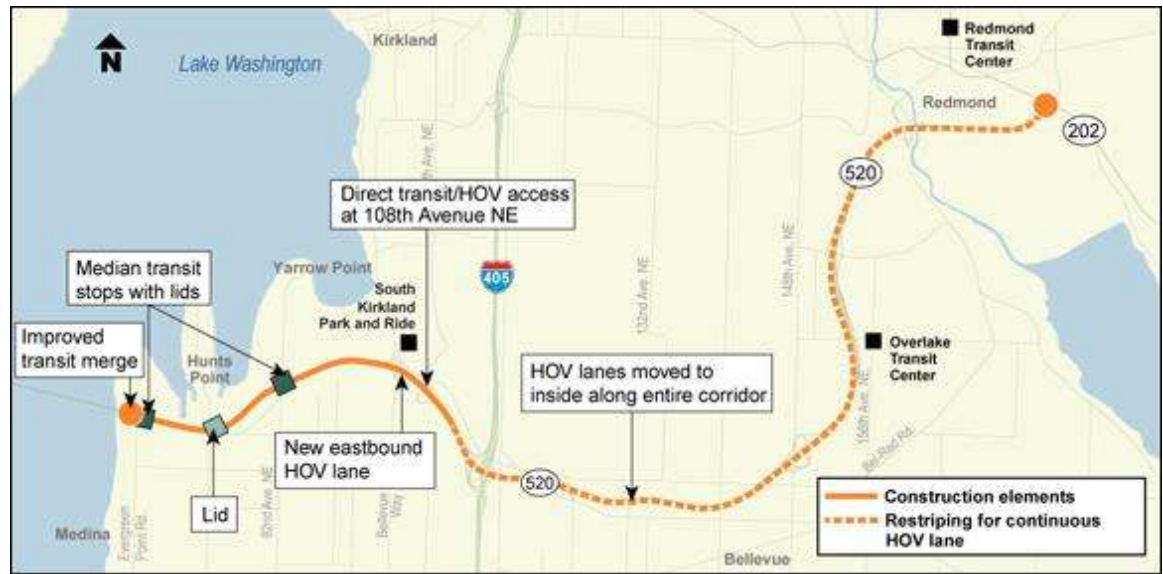
Figure 5.2. Medina to SR 202 Project Area