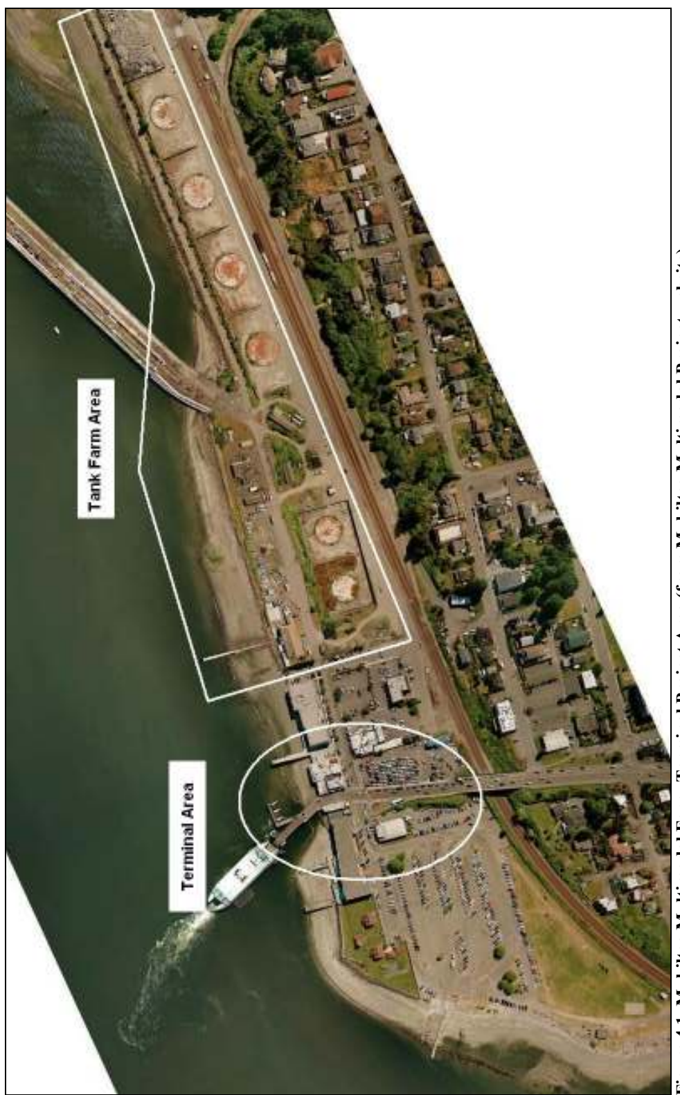
Figure 4.1. Mukilteo Multimodal Ferry Terminal Project Area