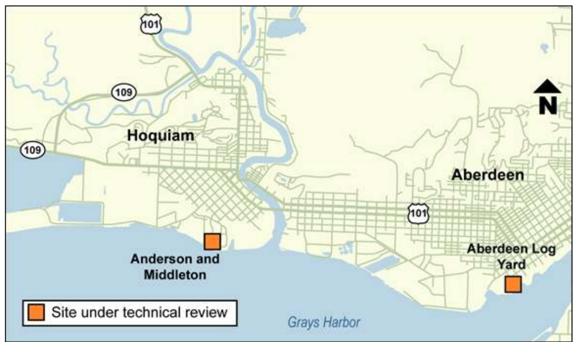
Figure 5.3. Pontoon Construction Project Area

The Pontoon Construction Project will construct pontoons in Grays Harbor for the SR 520 Program (Figure 5.3). Two build alternatives were considered for the possible pontoon construction site: the Anderson & Middleton Alternative in Hoquiam, Washington, and the Aberdeen Log Yard Alternative in Aberdeen, Washington (WSDOT and FHWA, 2010a).