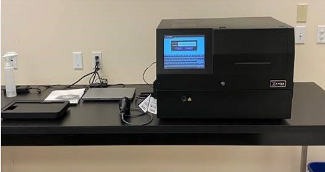
Figure 2: One ANDE 6C Rapid DNA system was installed in the WSP CODIS Laboratory in June 2023