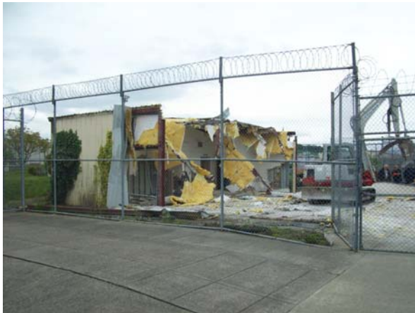
View from tower during construction

Per the NIC recommendations, DOC tore down a building (picture below) at MCC located immediately to the side to the chapel. It was noted the tower had limited visibility, even with the camera system, and that the building was not used for staff, programs, or any activities.