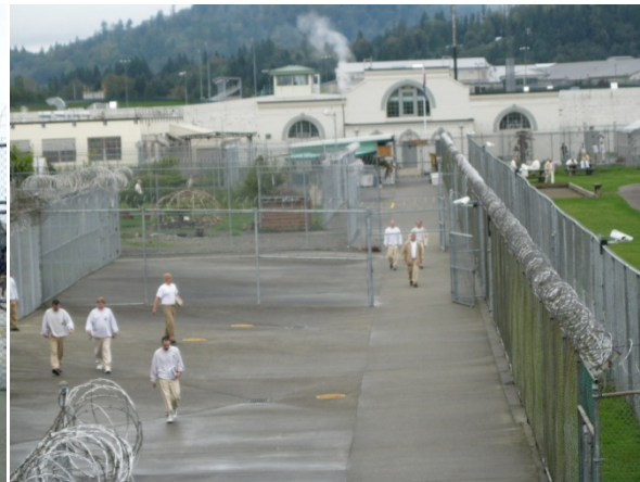
View from tower after construction