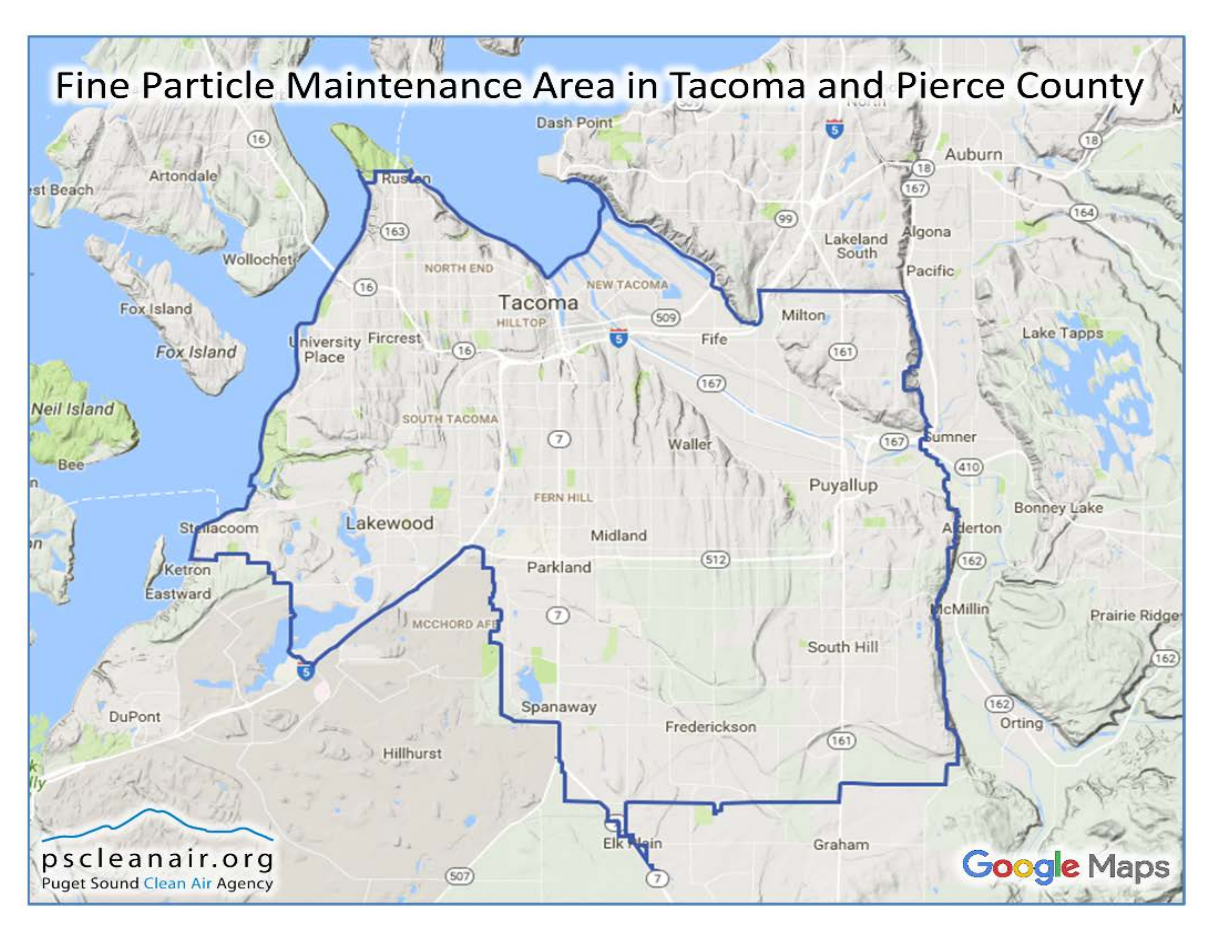
Figure 1: Map of Fine Particle Maintenance Area in Tacoma and Pierce County

In 2012, the only area that did not meet the NAAQS was the Tacoma-Pierce County area shown in Figure 1. EPA classified this location as a nonattainment area (not meeting the NAAQS) for 24-hour fine particle (PM<sub>2.5</sub>) pollution in 2009. The primary cause of poor air quality was wood smoke from home heating during winter evenings with cold temperatures and low wind speeds.