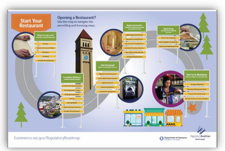
The city of Spokane's Get Started roadmap gives entrepreneurs a comprehensive overview of the path to opening a restaurant.

As part of the restaurant process, Commerce and its partners developed regulatory assistance tools and techniques – and an overall approach to this work – with the expectation that the methods and tactics could be adapted to other sectors.<sup>2</sup>