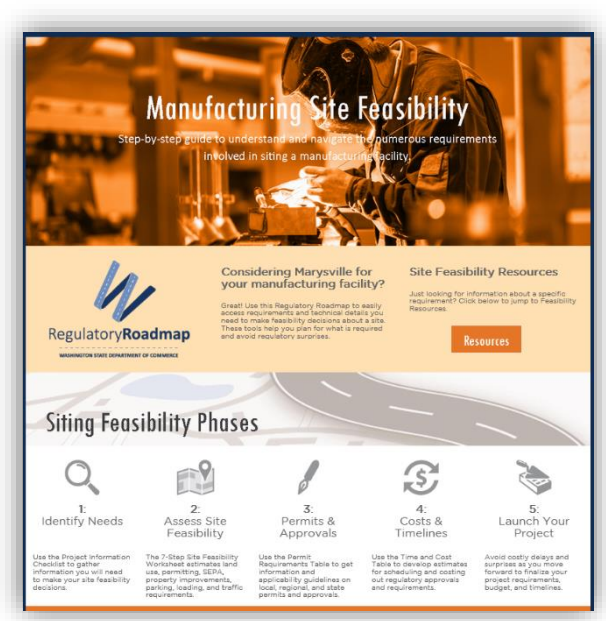
The city of Maryville recently launched its Manufacturing Roadmap site, part of the Snohomish County pilot project.

For this pilot, information gleaned from surveys, group discussions and interviews with manufacturers on their regulatory experiences was compiled and used to prioritize streamlining opportunities. The manufacturer representatives cited lack of predictability and lack of transparency as key factors that affect the cost and success of their expansion projects.