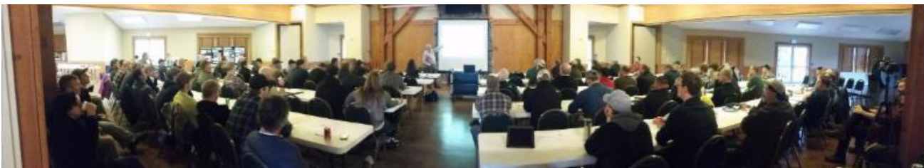
Whatcom County: Dairy operators in four-hour manure-nutrient management session hear experts describe best management practices, rules and regulatory updates and required recordkeeping for water quality protection.

In July 2015, ESSB 6052 Senate Bill Section 309(3) (page 120-1) provided funding for additional training programs for farmers who apply manure across Washington State. WSDA issued the first request for proposals on September 15, 2015 for agronomic education and outreach. In addition, the agency issued a news release announcing the request for proposals.