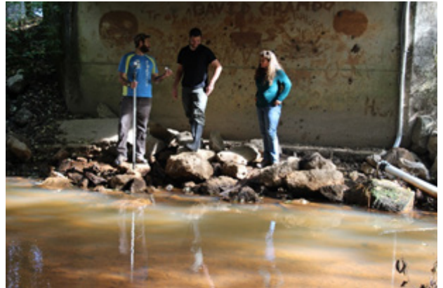
Figure 2- Training new inspectors about water quality sampling.