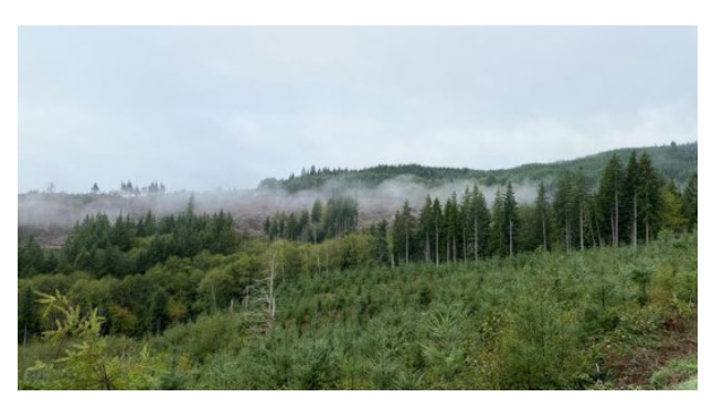
Mix of stand ages on the Deep River Woods land purchase

Together, the four parcels comprise 9,115 total acres of working forest with highly productive soils. Combined, these four parcels include approximately 1,000 acres of forest that can be harvested now, and roughly 1,050 acres that will become merchantable (trees large enough for harvest) within the next decade. Other areas include younger forest that will require more time to grow, as well as streamside forests and non-forested areas such as roads. All parcels