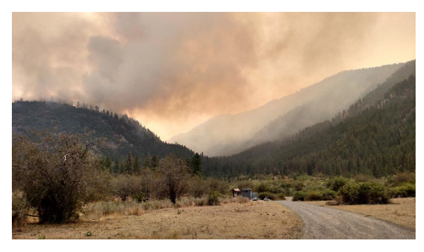
2015 Okanogan Complex Fire in Eastern Washington

In the meantime, record high summer temperatures and low rainfall primed the landscape for fire. Wildfires raced across nearly a million acres, destroying 500 structures along with timber<sup>6</sup>. Three firefighters lost their lives and four more were severely burned when their position was overrun by flames. Other impacts include a toxic algal bloom along the coast amidst a marine heat wave, and agricultural loses due to drought<sup>7</sup>.