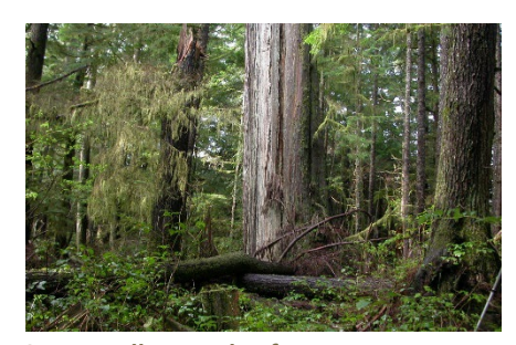
Structurally complex forest on state trust lands

DNR has made considerable progress on fulfilling this section of the proviso. To begin, DNR conducted a careful screening