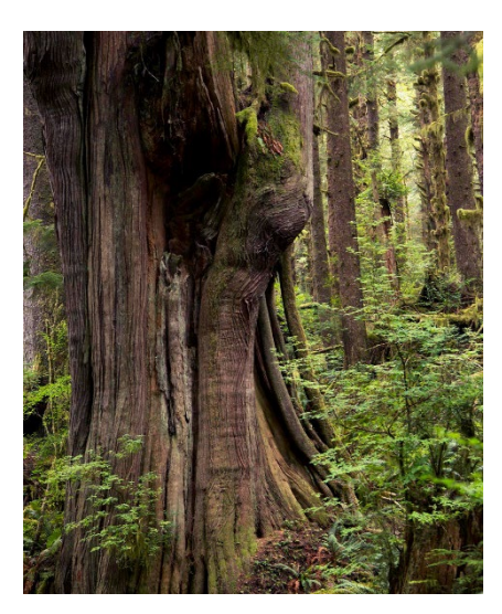
Massive western redcedar growing in a structurally complex forest on state trust lands

this requirement, DNR first identified forests that 1) met a minimum threshold for live carbon (in other words, live tree biomass) per acre, and 2) had structural characteristics that are typical of forests in the later stages of stand development, such as Maturation 1 and 2. To determine if forest stands met these structural requirements, DNR used a variety of data, such as trees per acre over a specific diameter and number of canopy layers. DNR used its remote sensing forest inventory system (RS-FRIS) to complete this work. DNR excluded any forests that are already permanently deferred from stand replacement