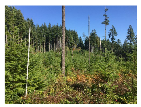
Working forest on state trust lands

Once sufficient lands are purchased to replace the 2,000 acres of structurally complex forest, remaining funds will be used to purchase working forests for counties in western Washington that have been disproportionately affected by DNR's <u>State Trust Lands Habitat Conservation Plan</u> (HCP): Clallam, Jefferson, Pacific, Skamania, and Wahkiakum counties. The HCP is a contractual agreement between DNR and the Federal Services<sup>4</sup> that describes how DNR can meet its fiduciary responsibilities to trust beneficiaries and provide habitat for at-risk species, and is the primary means by which DNR meets the requirements of the