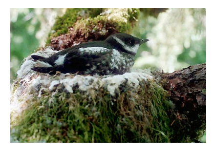
Marbled murrelets nest on the large branches of trees in older forests.

Any additional funding not needed to purchase replacement lands for the 2,000 acres of structurally complex forest will be used to purchase working forest for the western Washington counties most impacted by the implementation of DNR's 1997 <u>State Trust Lands Habitat Conservation Plan</u> (HCP): Clallam, Jefferson, Pacific, Skamania, and Wahkiakum counties. A contractual agreement between DNR and the Federal Services, the HCP includes conservation strategies for northern spotted owl and marbled murrelet habitat, much of which is located in these counties. Harvest restrictions on habitat in these counties has reduced timber revenue needed for essential services. DNR will designate and