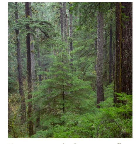
Young tree growing in a structurally complex forest

As explained in the introduction, this budget proviso involves conserving up to 2,000 acres of carbon-dense, structurally complex forest on state trust lands. To meet