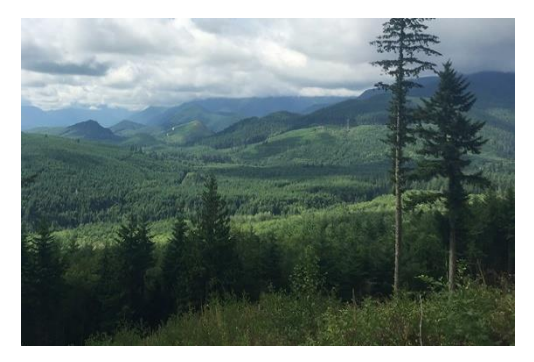
Forested state trust lands

In addition, DNR also has special obligations and responsibilities toward Tribes because the lands that DNR manages are the ancestral homelands and territories of