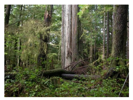
A structurally complex forest on state trust lands in western Washington

Potential management approaches developed by the work