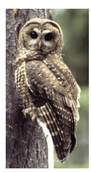
Northern spotted owl

According to a recent study completed by DNR<sup>5</sup>, between 1999 and 2017 there was little net change in the number of acres of forest on state trust lands that are either have, or are beginning to develop, the attributes of structural complexity. However, the location of these forests has shifted: