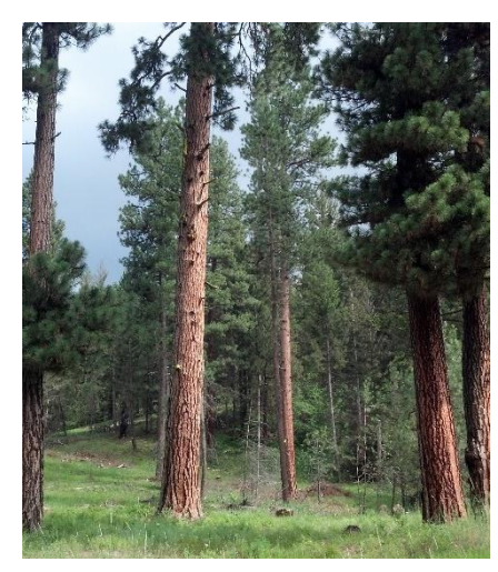
Ponderosa pine in eastern Washington

In the following section, DNR will discuss the major steps of this project.