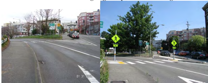
Olive Way Ramp Terminal Pad Enhancements – Before and After

position across the ramp and landings, repositioned the lanes on Olive Way, and added pedestrian activated Rapid Rectangular Flashing Beacons. The City of Seattle provided the concrete work and state forces contributed the electrical, signing, and pavement marking work.