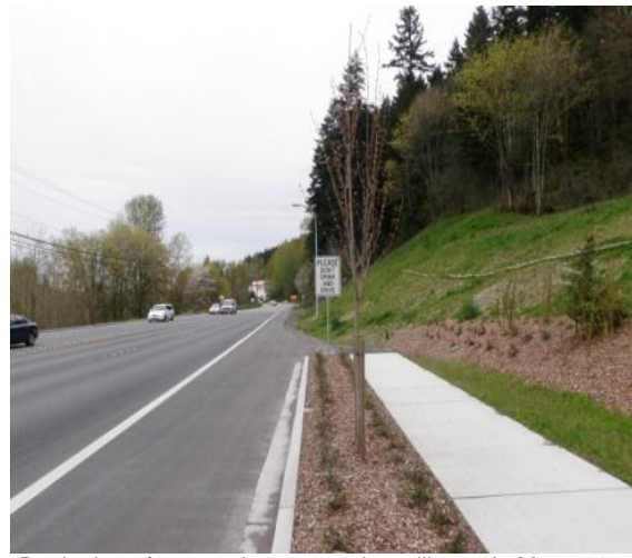
Beginning of stage 2A, construction will start in May 2012