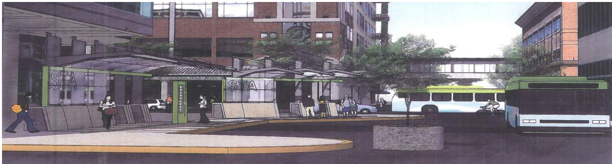
Spokane Transit, Plaza Improvements new bus shelters and street reconfiguration