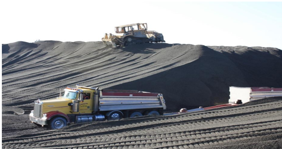
Intercity Transit, Hawks Prairie Park and Ride under construction