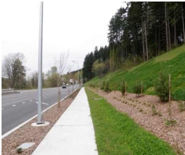
City of Bothell, SR 522 previously constructed segment

These projects were canceled for a variety of reasons, which include an agencies change in priorities, and unavailable matching funds.