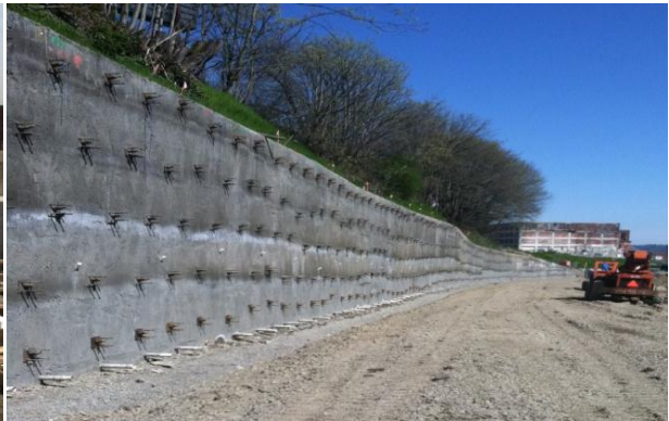
Sound Transit, Lakewood to Tacoma Commuter Rail D to M Street waterproofing Pacific Ave and retaining wall construction