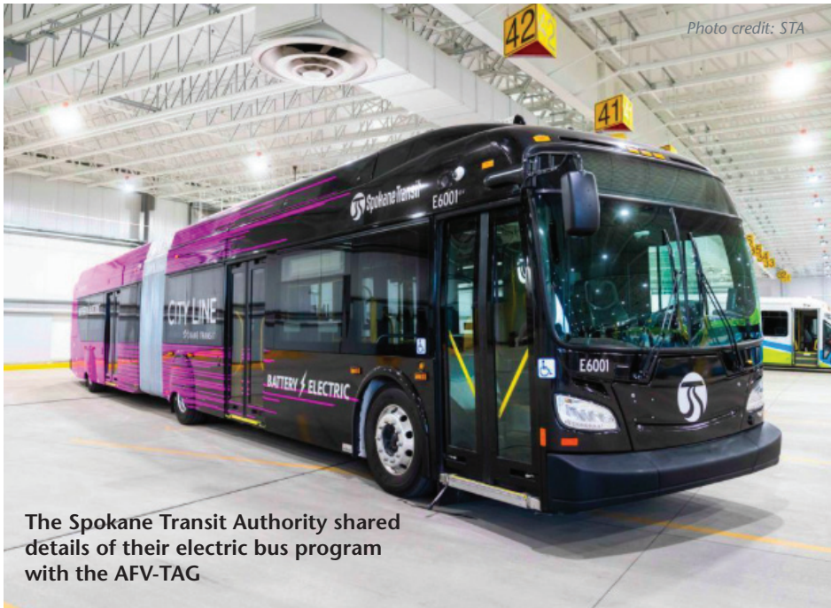
The Spokane Transit Authority shared details of their electric bus program with the AFV-TAG

Transportation group, Public Fleet Managers Association, NAFA Fleet Managers Association, Renewable Hydrogen Alliance, auto manufacturers and dealers, the electric vehicle supply equipment industry, and alternative fuel companies.