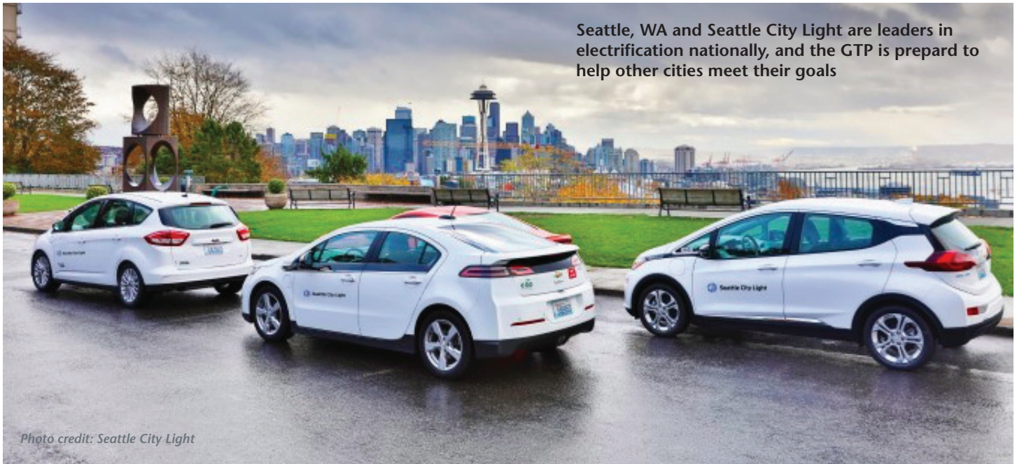
Seattle, WA and Seattle City Light are leaders in electrification nationally, and the GTP is prepared to help other cities meet their goals