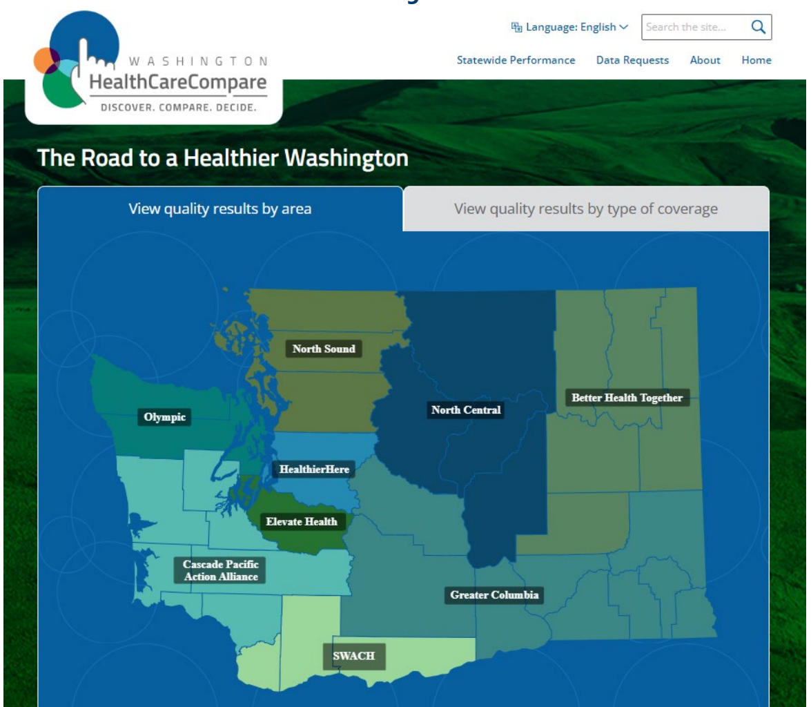
Image 3: Screenshot of the WAHCC where you compare the cost and quality across Accountable Communities of Health regions