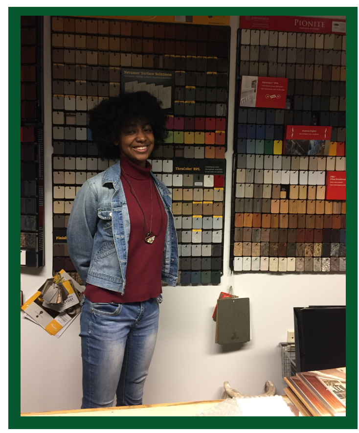
Highline Big Picture student at her internship site with an architect firm

c. The Work Group recommends the SBE review the Profile every ten years to ensure the skills still reflect the top needs of Washington's communities.