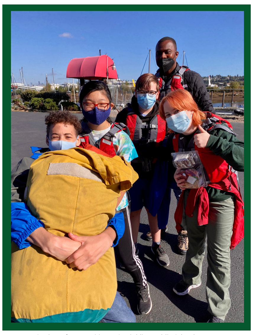
Students from Maritime HS (Highline Public Schools) on Puget Sound excursion

Find the full report on the MBL Work Group web page at <a href="mailto:sbe.wa.gov/mbl">sbe.wa.gov/mbl</a>.