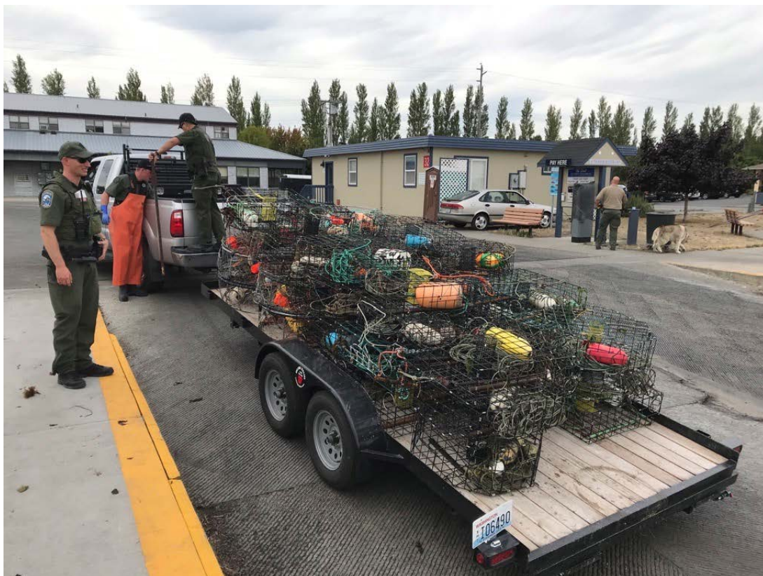
Figure 1. Recovered derelict pots on a trailer in Port Townsend following an enforcement gear sweep in 2021.

To fulfill requirements of RCW 77.32.430, dedicated derelict shellfish gear recovery funds expended in 2022: $244,035