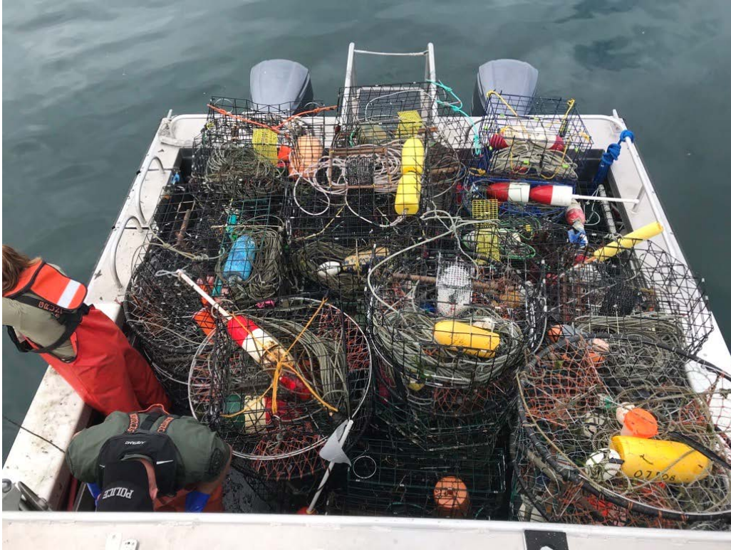
Figure 2. Recovered derelict pots stacked on the back deck of the WDFW R/V #699 during an enforcement gear sweep.