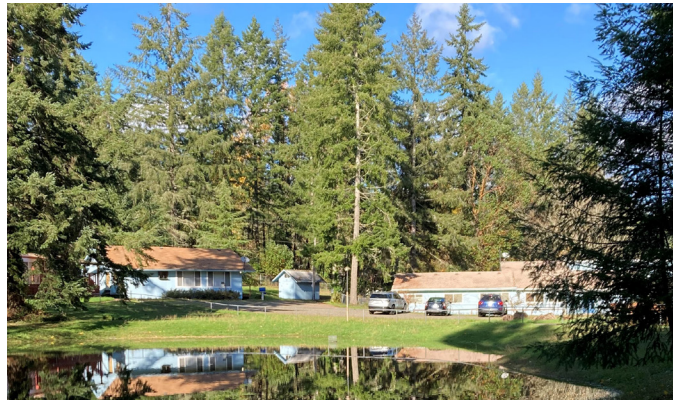
Stabilization, Assessment and Intervention Facility located in Pierce County

In 2019, the DDA submitted the Legislative Report, Rethinking Intellectual and Developmental Disability Policy to Empower Clients, Develop Providers, and Improve Services a process guided in collaboration with the William D. Ruckelshaus Center. A recommendation from this report was to expand access to crisis services for clients currently supported in the community. In 2019, the Legislature provided funding to DDA to develop state-operated stabilization services to eligible DDA clients with an identified need. Under Chapter 388-847 WAC, DDA created the Stabilization, Assessment and Intervention Facility to deliver stabilization services for up to 90 days to clients with complex behavioral health needs.