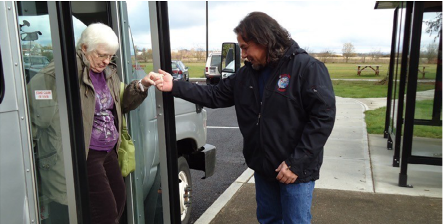
A Cowlitz Tribe Transit Services driver assisting a rider. Photo taken pre-COVID-19.

Through these connections, Yakima Transit provides access to the Greyhound Bus Terminal, Union Gap Transit, and People For People’s Lower Valley Community Connector.