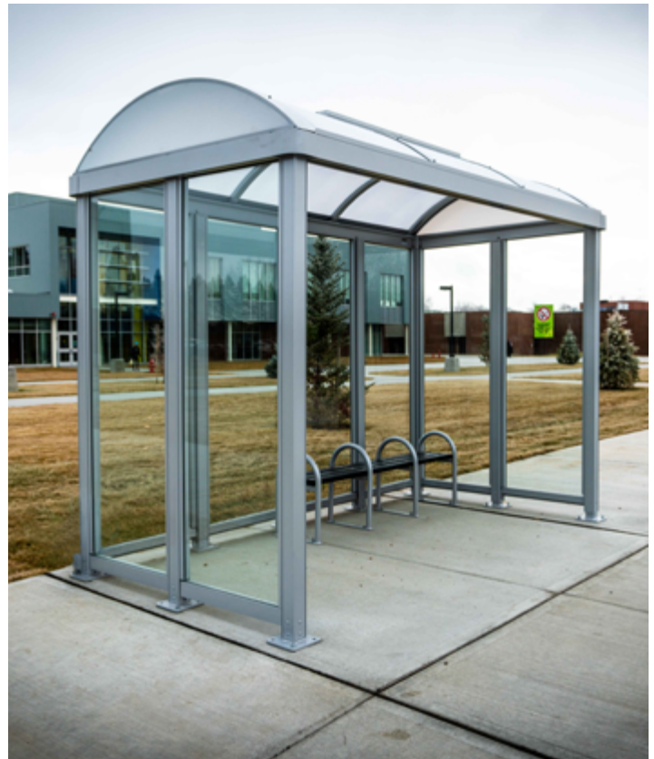
New shelter at Spokane Falls Community College.

The Spokane Falls Community College Transit Station's dedicated transit roadway allowed Spokane Transit to remove the existing stops with capacity, ADA-accessibility, and safety issues. New bus bays along the transit roadway will help accommodate the anticipated 30 percent growth in Spokane Transit's ridership by 2024.