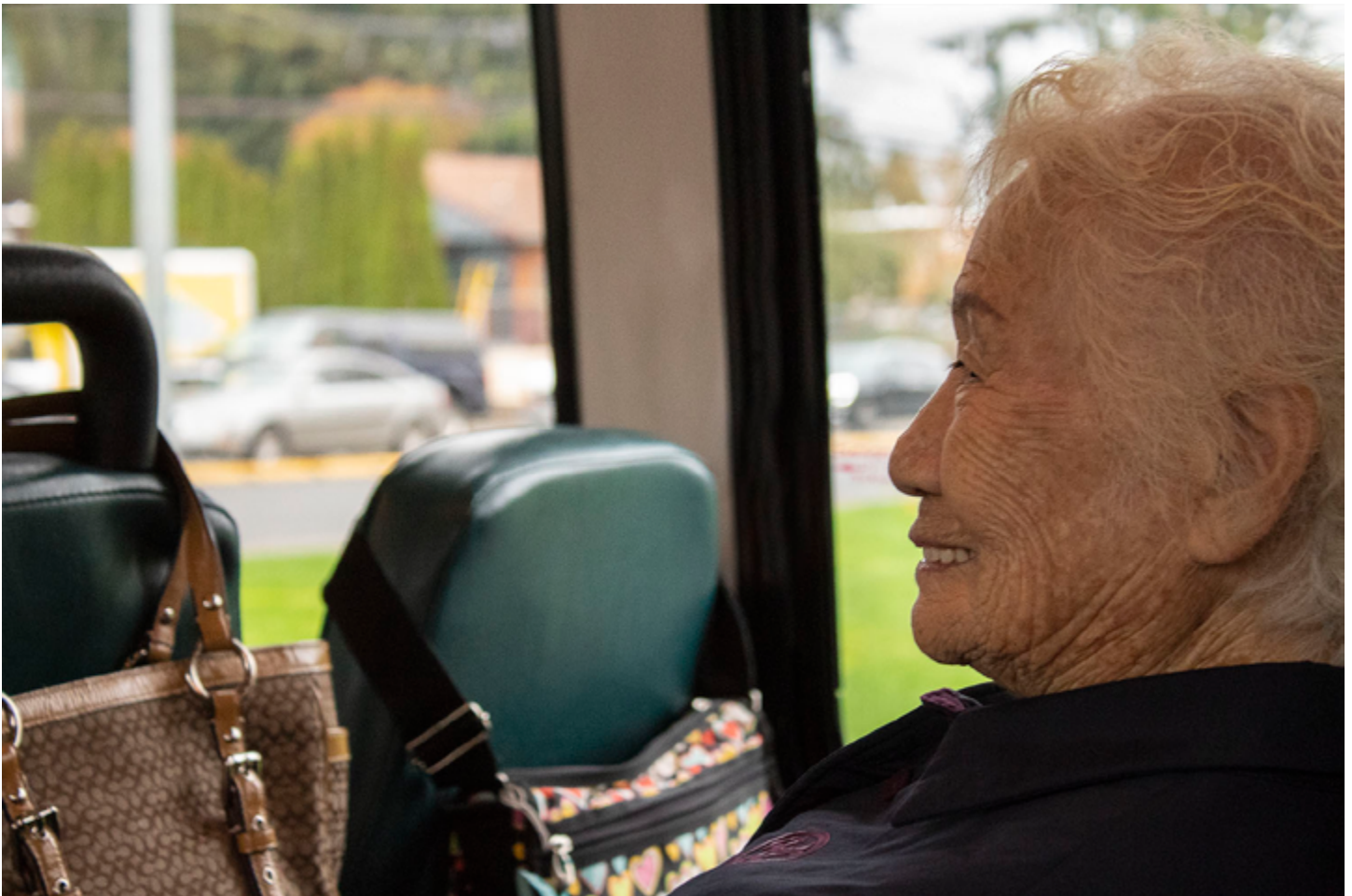
A Homage Senior Services rider using the provider's on-demand transportation. Photo taken pre-COVID-19.

The Special Needs Grant Program contributed $923,561 in the 2019-2021 biennium for the Transportation Assistance Program, about 46 percent of the project's cost.