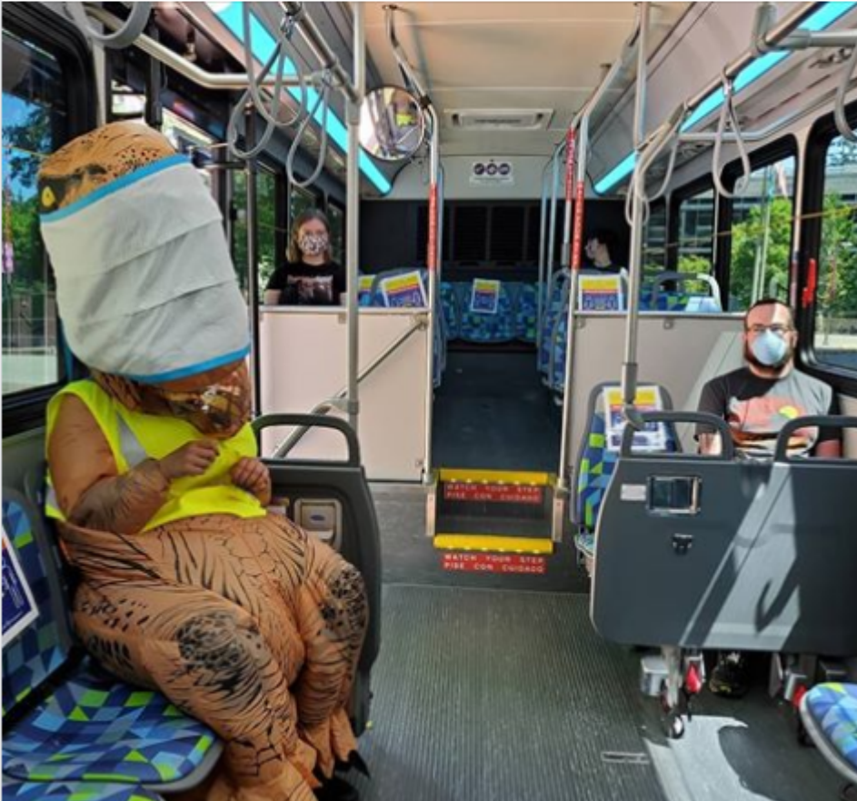
T-Rex reminding Intercity Transit riders that masks are required on the bus (courtesy of Intercity Transit).

T-Rex wants to remind you that face coverings are required on Intercity Transit. The health and safety of our employees, passengers and the community is our top priority. Learn more about the changes we've made for everyone's safety at www.intercitytransit.com/recoveryservice and how you can help. We're all in this together! #MaskUpWA