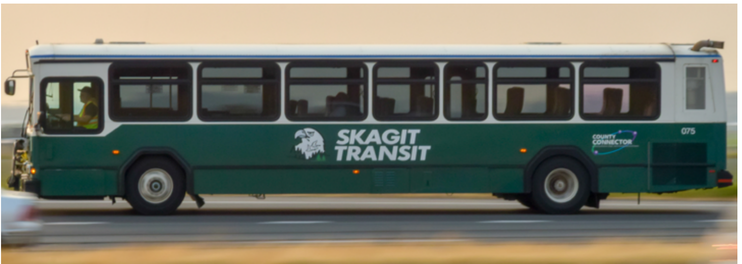
The Snohomish Connector operating on I-5.

For riders who used the service for trips to medical or social services in Everett or Seattle, the absence of midday trips meant a lot of time spent waiting for the bus. Riders had to either take an early bus and wait for their appointment or book an early appointment and wait several hours for the afternoon service.