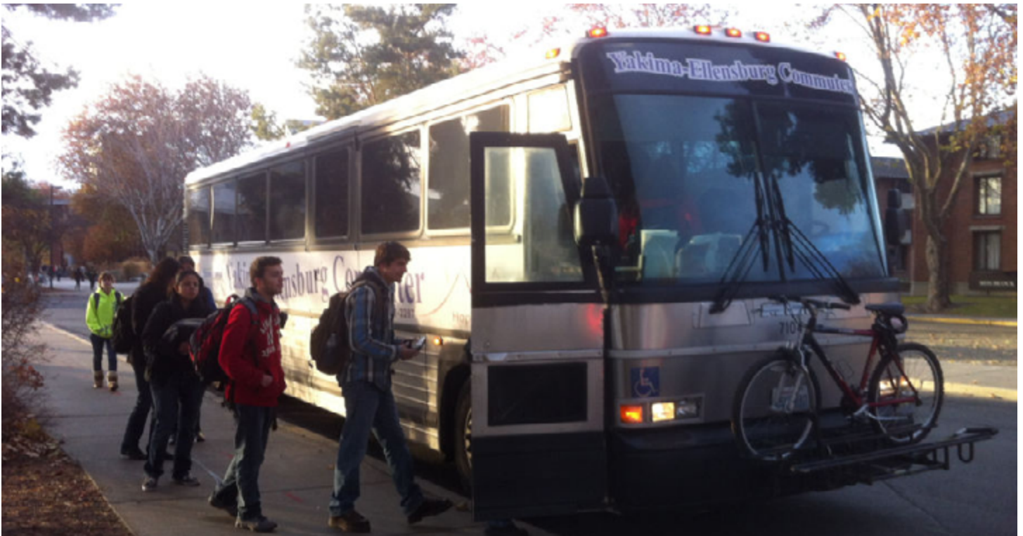
The Yakima-Ellensburg Commuter. Photo taken pre-COVID-19.