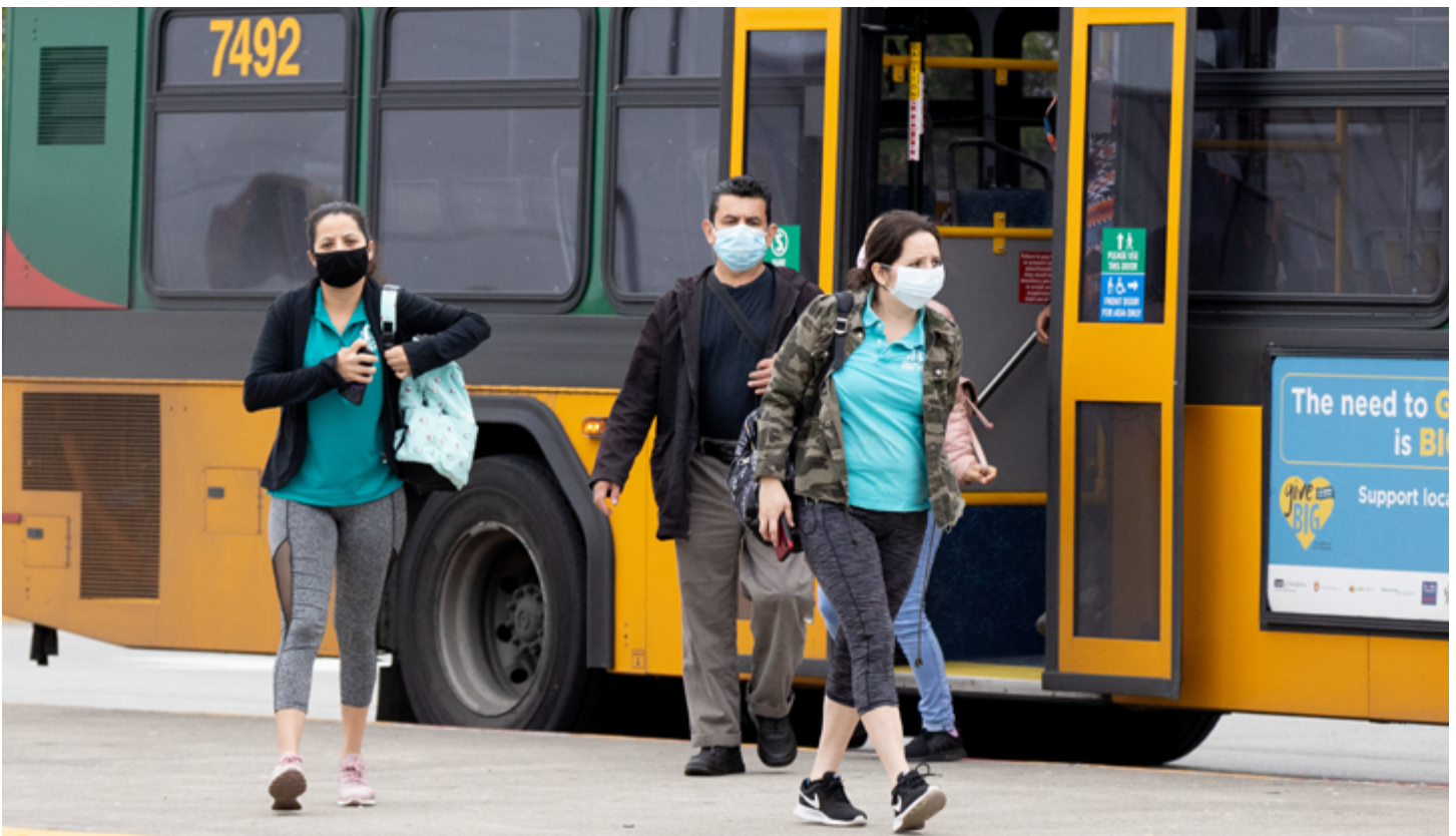
King county metro riders wearing personal protective equipment.

In some cases, public transportation providers are partnering with other social service and health agencies to fill gaps and meet mutual needs. Not only are providers creating innovative strategies to solve problems, they are collaborating to find their solutions.