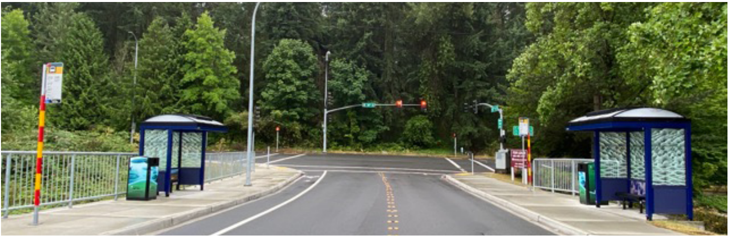
Bus stop improvements in Bellevue at 142nd SE and SE 36th St. (courtesy of King County Metro).

King County Metro predicts these solutions will save Route 245 seven to nine minutes per trip. This equates to 116,000–150,000 passenger hours per year.