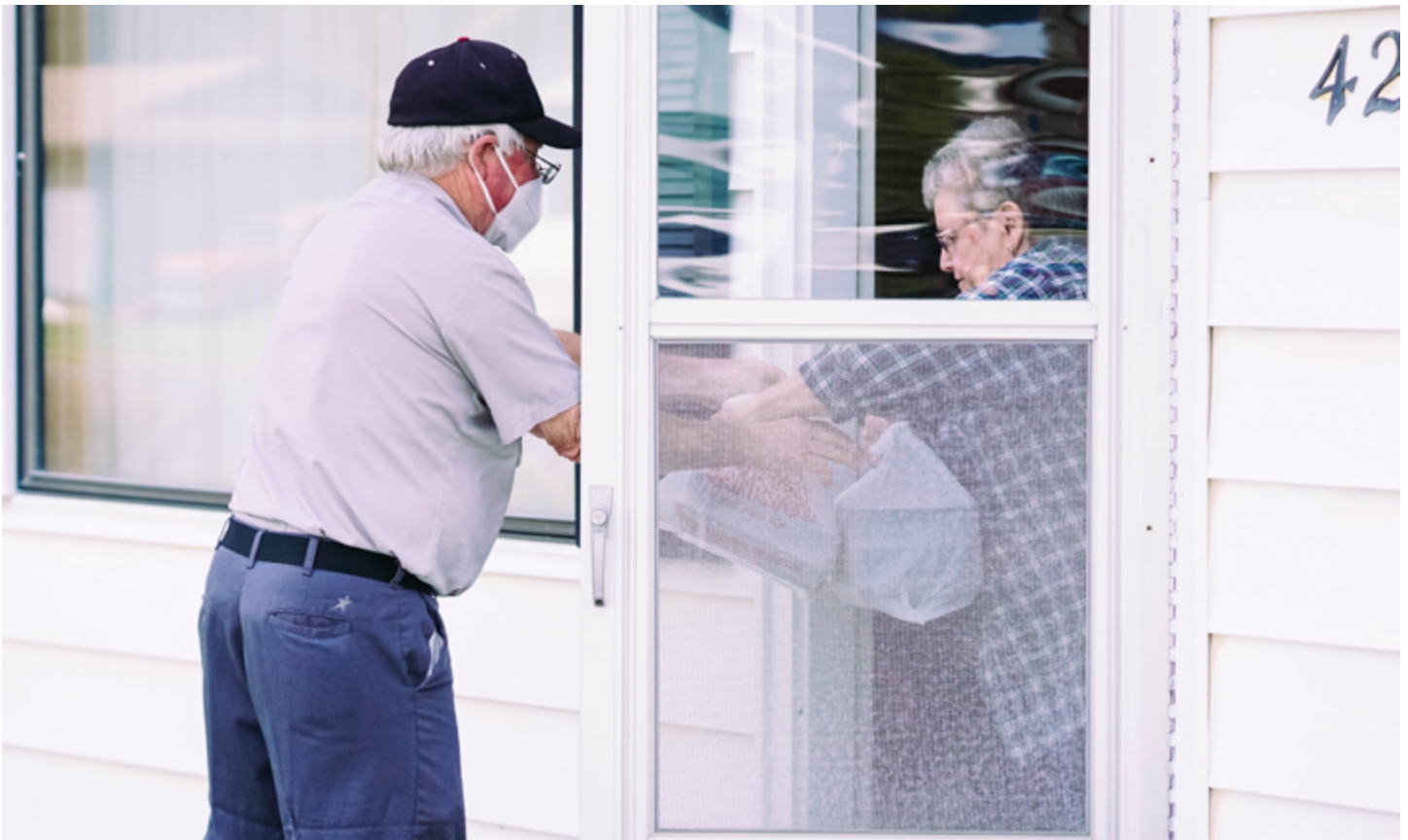
Twin Transit employee delivering meals.