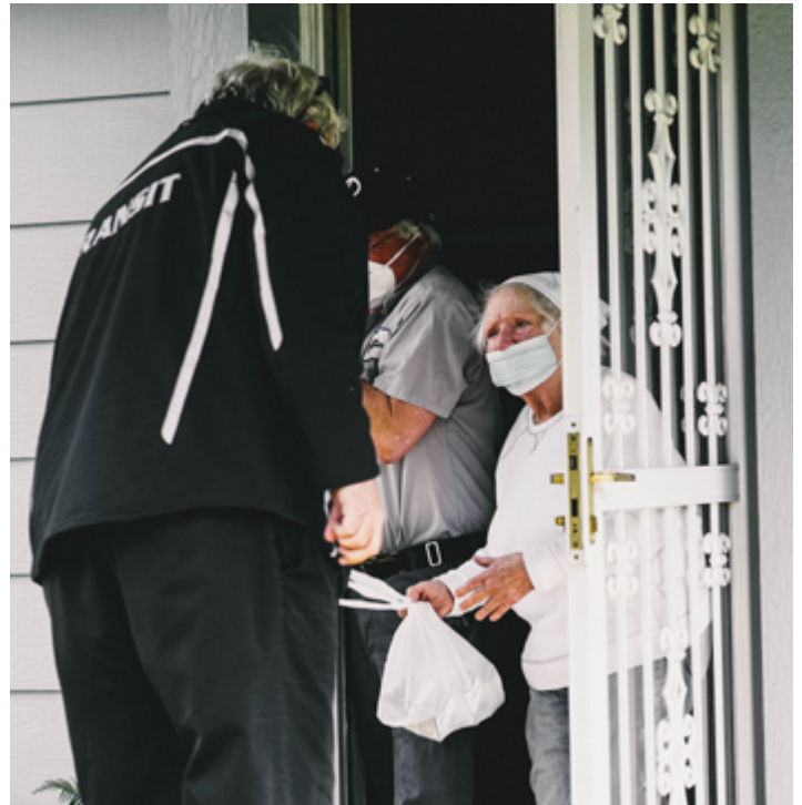
Twin Transit employee delivering meals.

As part of its meal and grocery delivery service, River Cities Transit in southwestern Washington is also taking clients to pick up their meals at various sites (e.g., Salvation Army, senior centers). They have also extended their normal wait times to allow seniors adequate time to receive their meals.