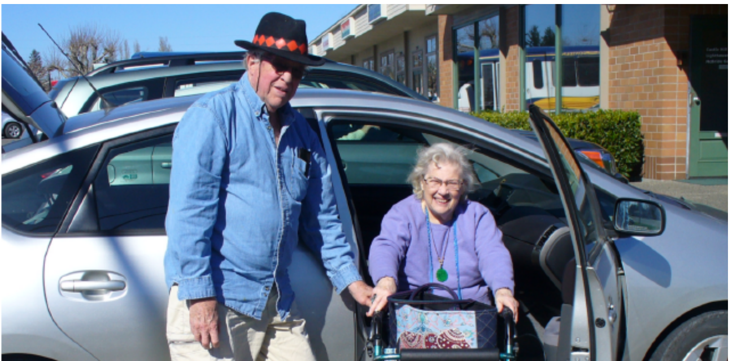
ECHHO riders. Photo taken pre-COVID-19.

The Special Needs Grant Program contributed $27,500 in the 2019-2021 biennium for ECHHO's Volunteer Transportation Program, 10 percent of the project's cost.